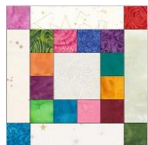
Block 2 Twin – 17

Scrappy Fabric 2" scrappy squares Twin – 24