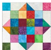
Block 1 Queen – 25