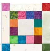
Block 2 Queen – 24